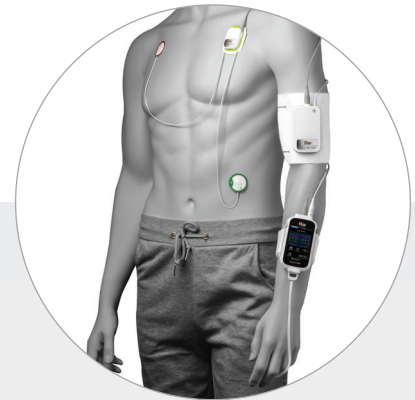
Radius VSM with SpO 2 , NIBP, ECG, Continuous Temperature, Acoustic Respiration Rate, and Patient Orientation, Position, and Activity Monitoring