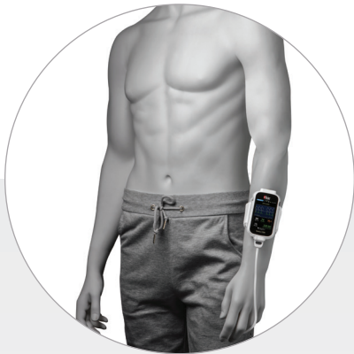
Radius VSM with SpO 2