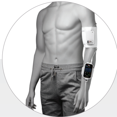
Radius VSM with SpO 2 and NIBP